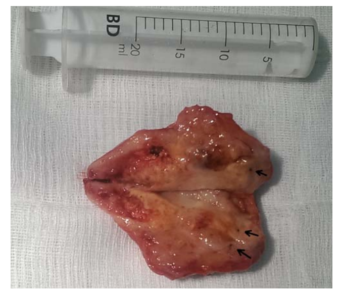
\ensuremath{\textit{Figure 2.}} Distal ureter. Arrowheads show the silk ligature from the native nephrectomy